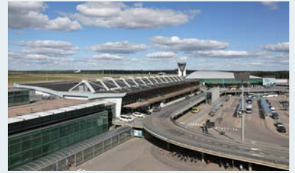
Helsinki-Vantaa Airport - Helsinki