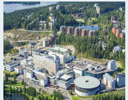
KYS Hospital - Kuopio