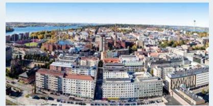
Residential & Commercial buildings - Tampere