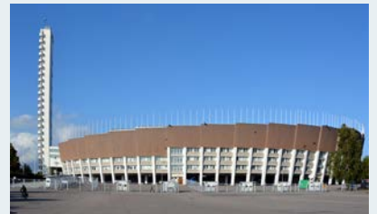
Olympic Stadium - Helsinki